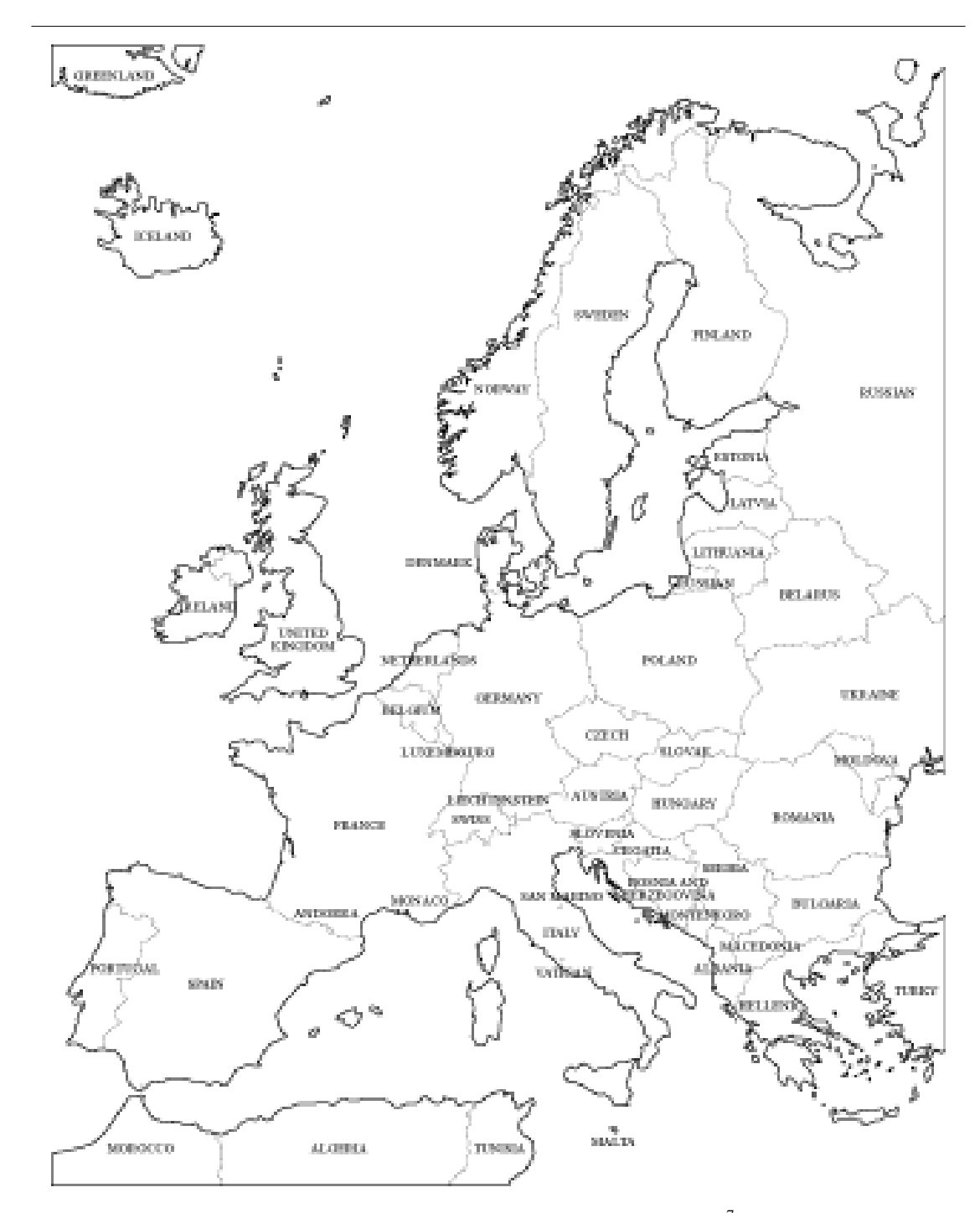
Figure 1.3: Europe (This map was obtained from http://english.freemap.jp/index.html<sup>7</sup> and is used with permission under a Creative Commons Attribution 3.0 license<sup>8</sup>.)