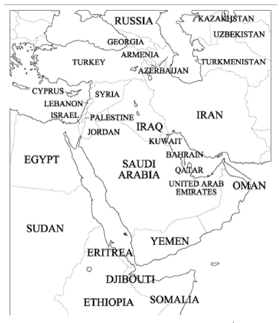
Figure 1.2: The Near East (This map was obtained from http://english.freemap.jp/index.html<sup>4</sup> and is used with permission under a Creative Commons Attribution 3.0 license<sup>5</sup>.)