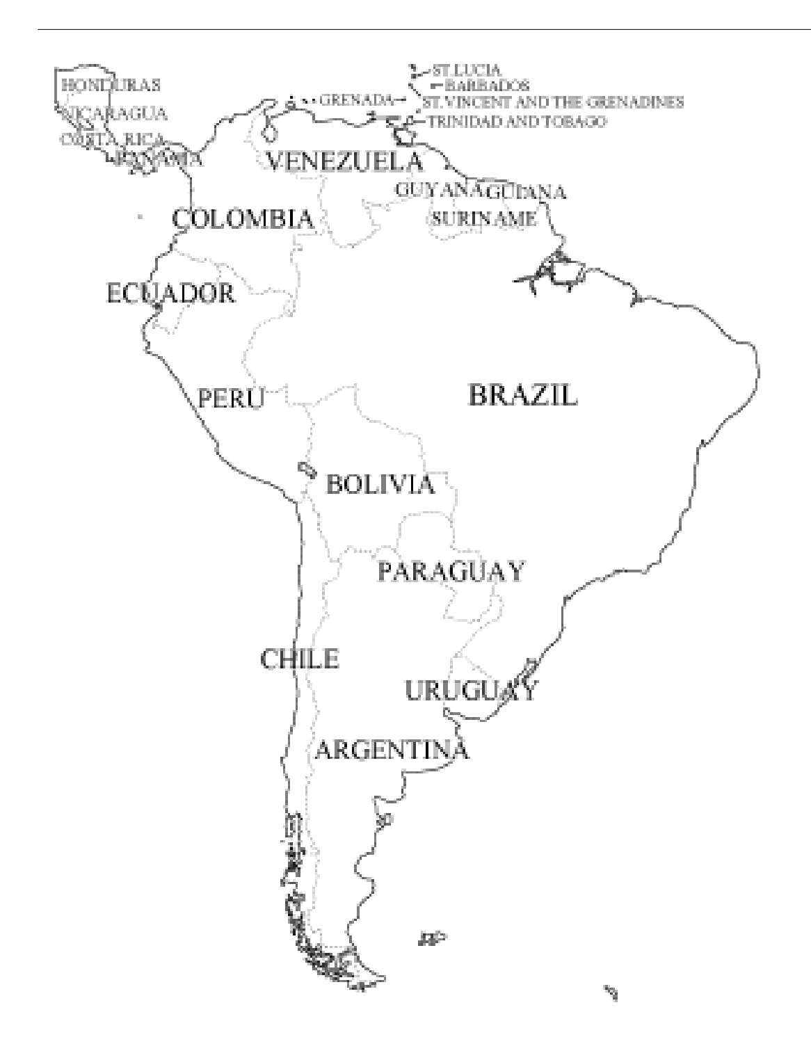
Figure 1.10: Mexico, Central America, the Caribbean, and South America