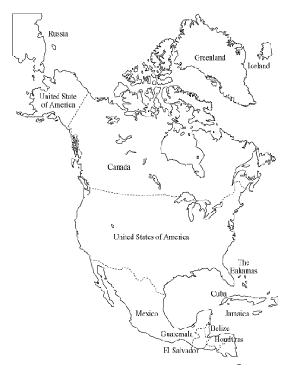
Figure 1.9: North America