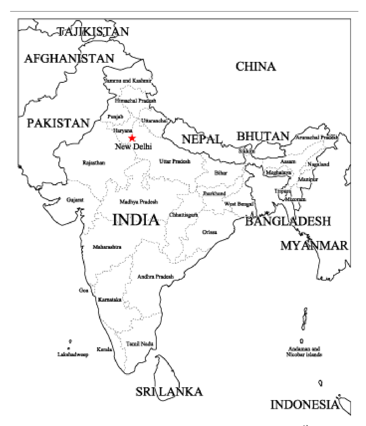
Figure 1.5: Indian Subcontinent This map was obtained from http://english.freemap.jp/index.html<sup>13</sup> and is used with permission under a Creative Commons Attribution 3.0 license<sup>14</sup>.)