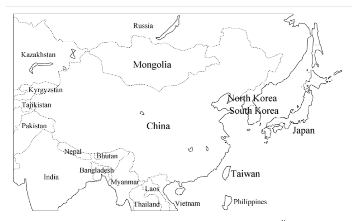
Figure 1.6: The Far East (This map was obtained from http://english.freemap.jp/index.html<sup>16</sup> and is used with permission under a Creative Commons Attribution 3.0 license<sup>17</sup>.)